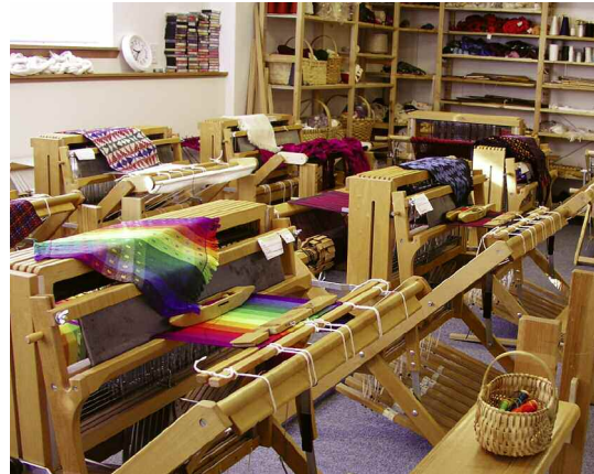
The classroom is equipped with over thirty looms—all pre-warped and ready for sample weaving.

Morning lectures are followed by afternoons at the looms weaving samples that illustrate the lessons. Students take home a complete hand-book of information and woven examples.